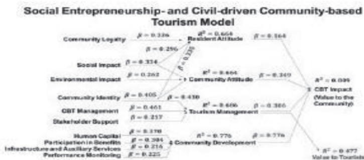
Figure 20 Huay Nam Guen Community

A total of 43 community members from Huay Nam Guen community and 45 from Doi Chang community participated in the questionnaire-based surveys, which lasted for a duration of one week in each community. Having extracted only the significantly correlated variables, to p = 0.001 significant levels, multiple regression analysis is employed, which supports the three broad-based hypotheses, as well as the theoretical structure which underpins on social psychological and cybernetic psychology theories. Figure 20 presents the overall social entrepreneurship-driven CBT perceptions and attitudinal configuration of Huay Nam Guen community. Figure 21 presents that of Doi Chang Community, and Figure 22 shows the configuration for the two combined cases. Many variables are positively correlated, but are not revealed to significantly able to explain the variance of the relevant dependent variables shown in Figures 20-22.