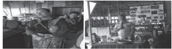
Figure 9 Interviewing the Leaders of the Lisu Communities