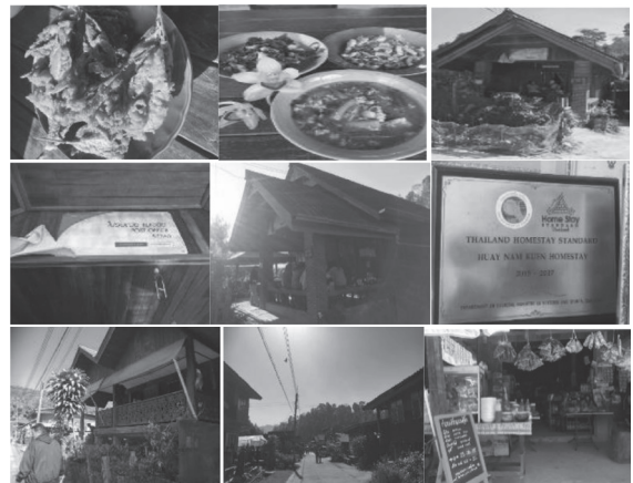
Figure 8 Homestays Project and the Service Activities Offered by the Community

Theme 3: Homestay Service, Challenges and Stimulating Drivers Homestays and relevant service activities, as shown in Figure 8, were added, a year ago, as an extended business opportunity on top of the original tea cultivation. The community-based homestay shares common features such as every household has gardens of vegetables and planting of flowers as self-sufficiency sources of food and income, and standards of infrastructure. Most importantly, each household shows a consistently friendly and good hospitality service attitude towards the tourists.