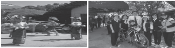
Figure 3 Cultural Dance and CSR Activities of the Community

sustainability for the community for continuity that has both cooperative advantages and competitive advantages.