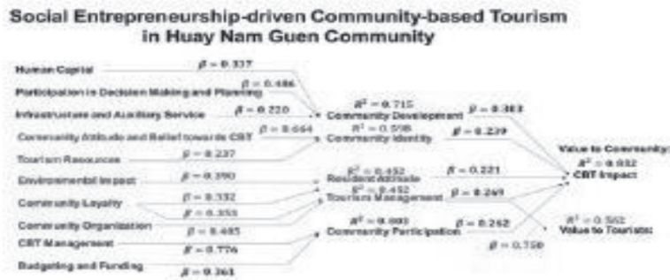
Figure 21 Doi Chang Community