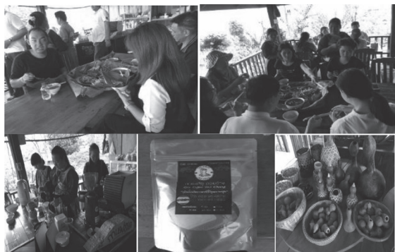
Figure 10 Lisu Resort – Pictures arranged in the Sequence of Lunch Enjoyment, Coffee Testing, Coffee Product, and Village Handicrafts, General Resort Environment, and Coffee Roasting