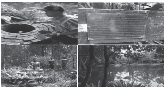
Figure 15 Biodiversity of the Community Environment and Opportunity for Eco-Tourism Tracks

The Akha group, which includes also a broad diversified tribe, has shown a lot of potential development opportunities waiting to be systematically explored and developed. The ethno-observation shows there are rich cultural resources which CBT can take advantages to capitalize to help promote and develop economic and community development. There are wide spectrums of cultural resources, in particularly dealing with the unique uses of herbal resources available in the community environment for medicinal benefits (Figure 16), the cultural handicrafts (Figure 17), the lifestyles, and the culinary specialty dishes. Currently Akha group in Doi Chang has started to offer community-based homestays as shown in Figure 18, as well as coffee and fruit plantation tracking and learning for the tourists shown in Figure 19.