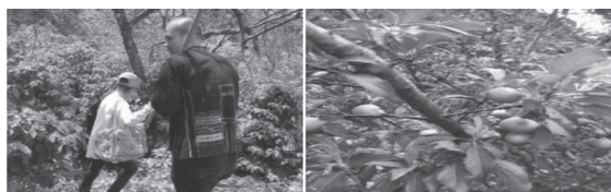
Figure 19 Akha Coffee and Fruit Farms

found, the Akha communities have maintained medicinal knowledge from generations to generations, and have benefited not only the within-community but also outside the community. The Akha communities exploit the diverse use of herbal plant parts which include infructescences, exudates, bark and stem, and leaves, and their traditional botanical knowledge of these medicinal plants, for medicinal benefits which include blood system disorder, skin and subcutaneous cellular tissue disorders, digestive system disorder and injuries, and for metabolic system disorders. The Akha group, as shown in the Figure, usually prepares these medicinal herbal elements through pounding, hot infusion, and decoction, which are usually used through intakes or skin-surface usage.