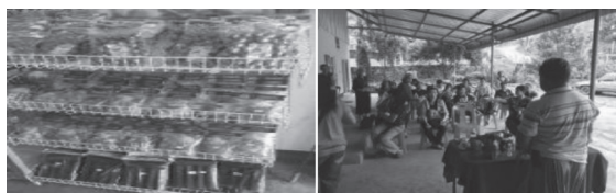
Figure 11 Lisu Macadamia Factory – Products Introduction

The significant theme of the community-based tourism development is to develop a sustainable neighborhood and community that serves as livelihood (for instance, shown in Figure 12, the local handicrafts) and villages as the tourist attraction sites, shown for instance in Figure 13. The latter will provide a more stable sustainable source of income to the community through tourism that centralize on tourist experiential learning of the different cultures and the ways of life of the communities, and how the communities use natural or man-made resources for the benefits of both the community livelihood as well as for tourism purposes. The key attraction of CBT destination thus deals with not only the unique quality of resources and tourism product or service design within the physical, geographical space, but most importantly the experiential features provided for the tourists embedded within the space, for instance, as shown in Figure