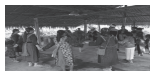
Figure 14 Tourist Experiencing the Lisu Cultural Dance with the Community Space