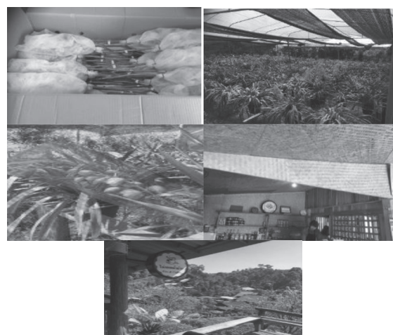
Figure 7 Cymbidium Flower and Café Projects of the Community

“Being brotherhood is an important stimulating force for our success – it provides shared understanding of how the community is to be developed in various aspects, such as tourism, new agricultural products or value-adding of existing products and services. When the community is absorbed in brotherhood, the community can establish collective awareness of eventual economic, social and environmental impacts easily.”