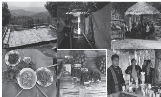
Figure 18 Akha Community-based Homestays