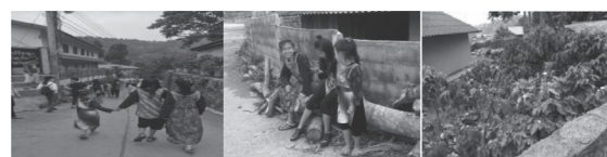
Figure 13 Community Life and Tourist Attractions