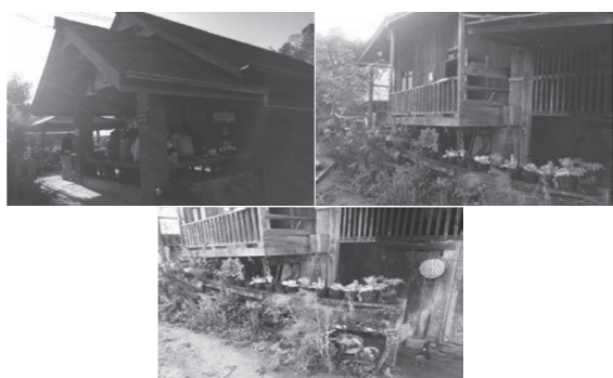
Figure 6 Homestays in the Community

is seen as an important stimulating or enabling force for ideas generation. That is, when a trusting environment is robustly developed within the community, it fosters positive cognitive, emotional, agentic and behavioral responses of the community members towards the change measures (cf. Piderit, 2000), which is evidenced in the new homestays project that the community installed a year ago, as shown in Figure 6.