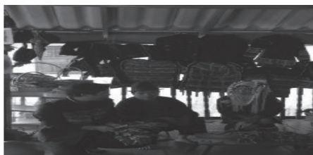
Figure 16 Akha Medicinal Herbs Knowledge Sharing

The Akha group, which includes also a broad diversified tribe, has shown a lot of potential development opportunities waiting to be systematically explored and developed. The ethno-observation shows there are rich cultural resources which CBT can take advantages to capitalize to help promote and develop economic and community development. There are wide spectrums of cultural resources, in particularly dealing with the unique uses of herbal resources available in the community environment for medicinal benefits (Figure 16), the cultural handicrafts (Figure 17), the lifestyles, and the culinary specialty dishes. Currently Akha group in Doi Chang has started to offer community-based homestays as shown in Figure 18, as well as coffee and fruit plantation tracking and learning for the tourists shown in Figure 19.