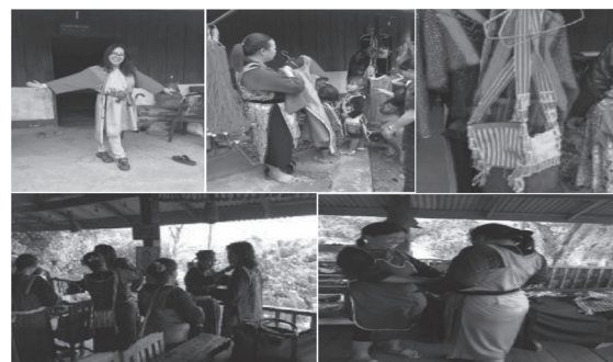
Figure 12 Local Handicrafts

14. The latter, the experiential quality of CBT, has so far been relatively undiscussed in the extant literature, and can be realized by undertaking a systemic approach to meet not only customer expectations but to arouse their experience-based learning desires by engaging the tourists within the spatial boundaries. For systemic advantages in CBT, the Porter's diamond model can be adapted which exploits the integrative design and uses of economic (i.e. funds), social (i.e. community unity, human capital) and environmental capital factors and destination attractors (for instance, as shown in Figure 15, the biodiversity richness of the environment and the opportunity as eco-tourism tracks) and support services to help realize CBT.