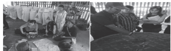
Figure 5 Community-based Learning Apart

Another obvious sustainability driver is team and the community-based learning, as shown in Figure 5, such as in solving productivity issues with tea leaves production and packaging, as well as quality control in Cymbidium flowers planting and delivery. By involving with constant dialogue and reflections over the issues that occur, it produces knowledge that can be used to benefit the operations. In addition, it is also shown that such team and community based learning further facilitates relational understanding which provide the foundation for trust development, essentially sharing Inkpen & Currall's (2004) finding.