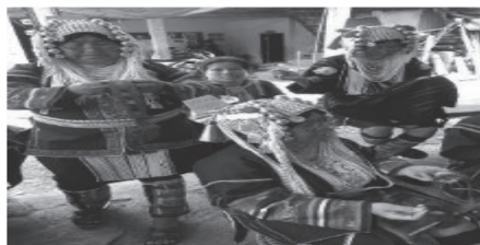
Figure 17 Akha Handicrafts