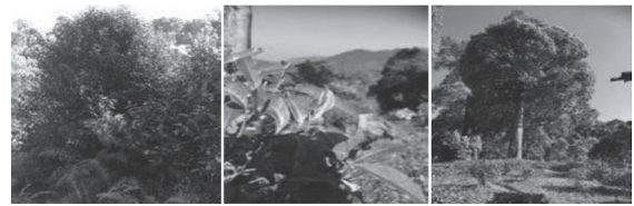
Figure 4 Ecological Health of the Environment

and the community, spiritually and educationally.