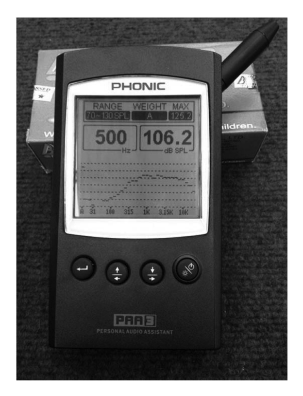
Figure 2 Sound measurement of loudness (Hz.) and reverberation time (RT-60).

The distance between the source of gunshot sound and the listener outside the shooting field can be determined by standard length of each shooting field, visible distance between the shooter and the target. Or It can be determined by the level of sound heard by the listener. In addition, the distance between the sound source and the listener must allow seeing the target area clearly which is necessary for rehearsal as well since any time the distance is 2 time longer, the volume of the sound is reduced to 6 dB.