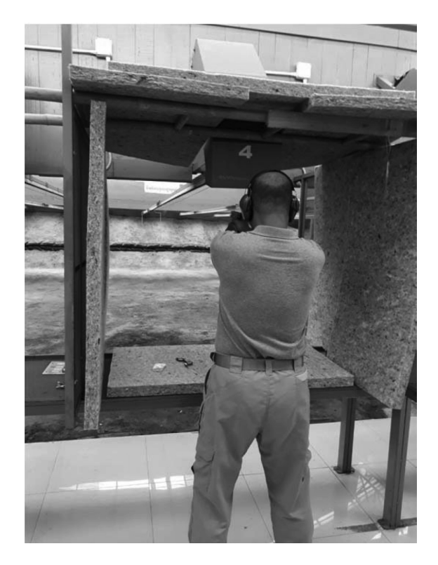
Figure 3 Using 4 square meters of 5 cm. thick recycled polystyrene drinking bottle as sound absorption material.

4.5 Perform initial interview with observers in the shooting field before and after the application of sound insulation.